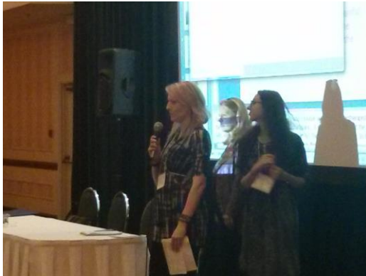
of a joint OATA/CATA Conference